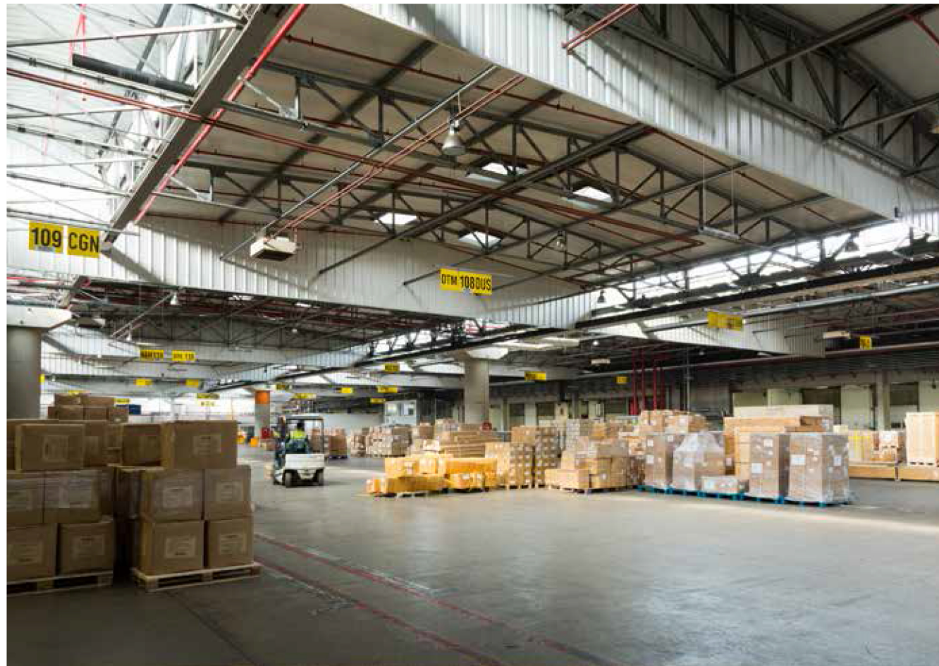
The cargo center has a capacity of 1 million tonnes per year.

of most major logistic providers, top-level maintenance, strong expertise in special cargo, pharma- & life sciences are among the key arguments. With mainly long-haul all-cargo operations, Luxembourg is a major hub for electronics and high-tech. A new free-trade zone for valuables has been inaugurated in September 2014.