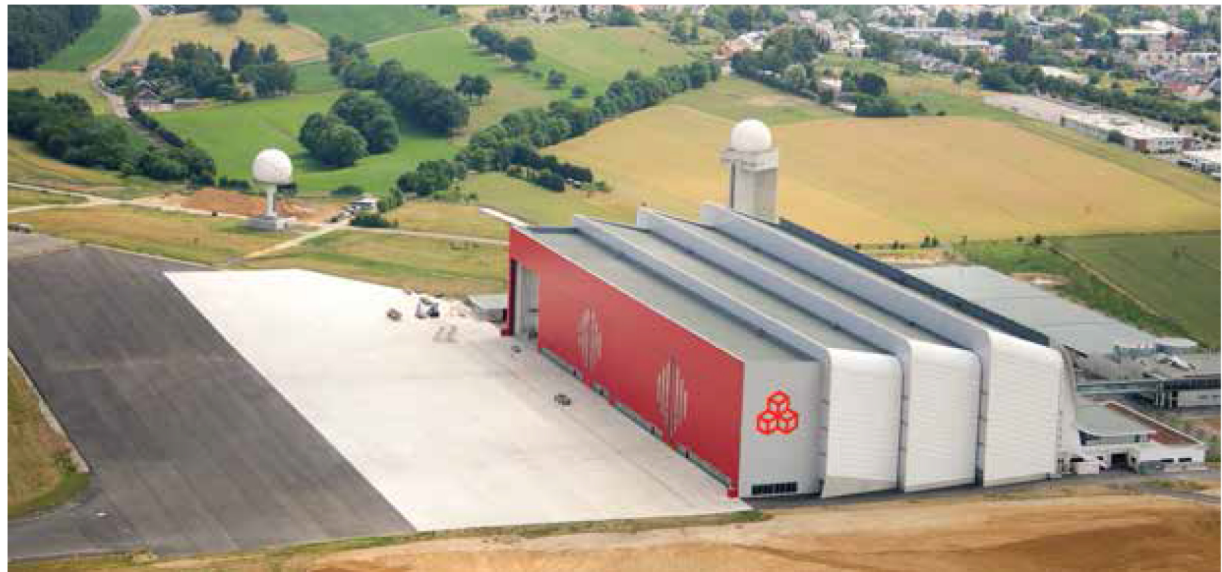
Cargolux maintenance hangar

Cargolux provides major aircraft maintenance operation (B737, B757, B767, B747...) and flight simulator (B747-400F, B747-8F) for Cargolux and third parties.