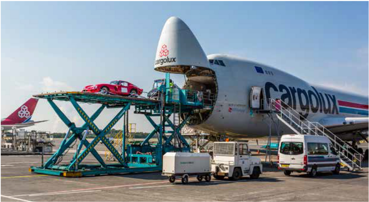
Internationally recognized certification agency for a.o. automotive, electronics and medical devices.