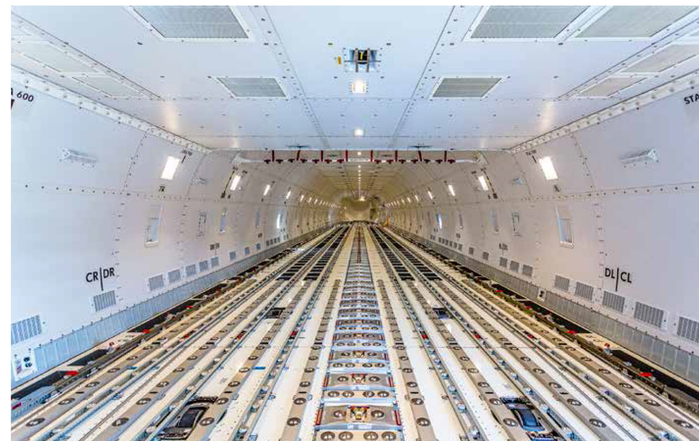
Cargo aircraft interior

Luxembourg Airport offers attractive landing and terminal charges with incentives for quiet and environmentally efficient aircraft. The formula used for the calculation of the Terminal Navigation Charge is shown on ANA's website.