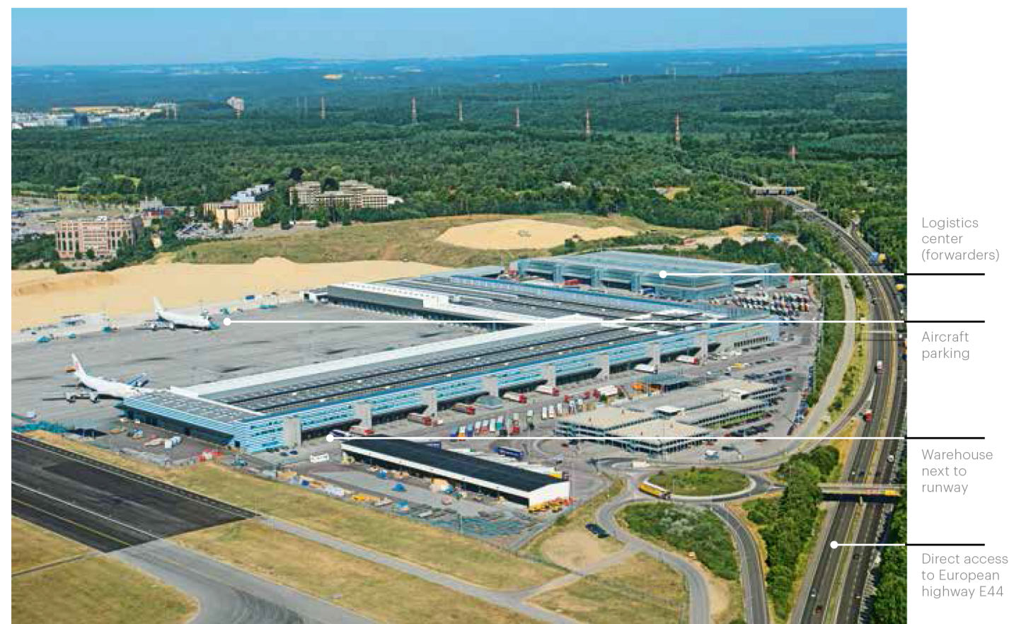
Luxembourg's cargo center is directly connected to the European highway system.